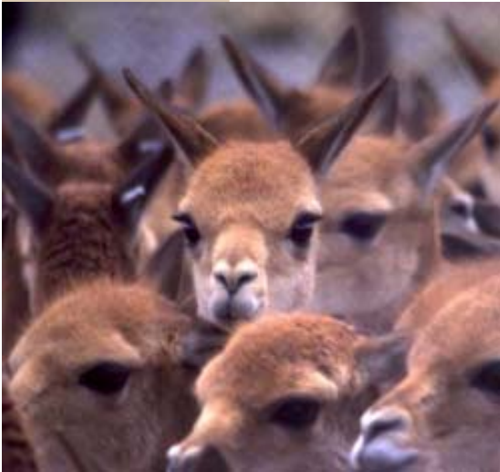
Above: Mark's photograph of wild vicunas, detained in the biannual chaccu in Peru. Below: Not the Tibetan Panel Coat appearing at a Star Trek premiere, but a nice one.