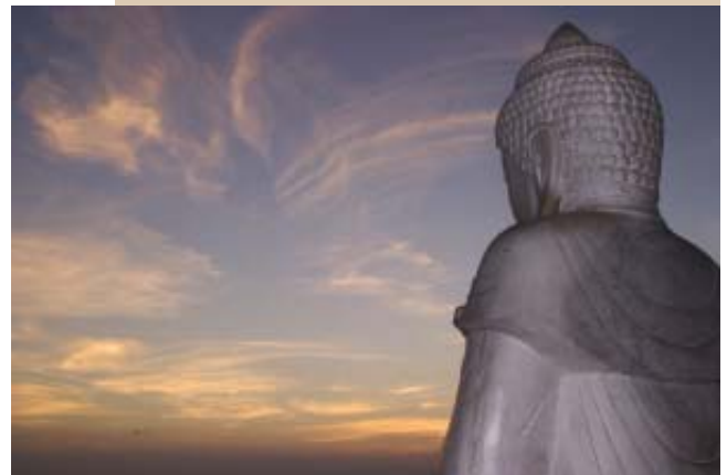
Buddha & Sky