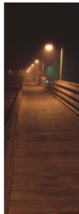
Into the Mist