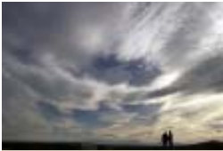
Three in Sky, Photo by Vicki Dodge